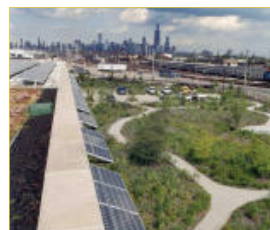
Solar panels, green roof