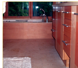
Reclaimed wood, low-flow fixtures